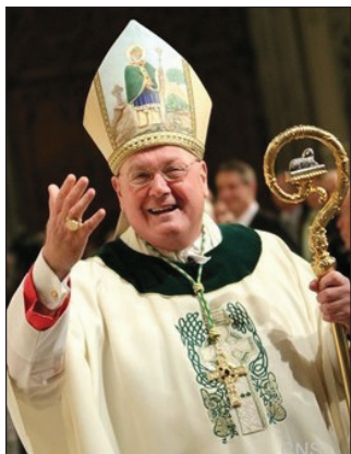
Cardinal Timothy Dolan Archbishop of the Diocese of New York City